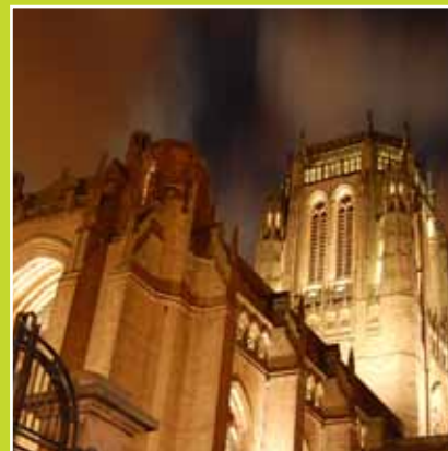
Anglican Cathedral, Liverpool